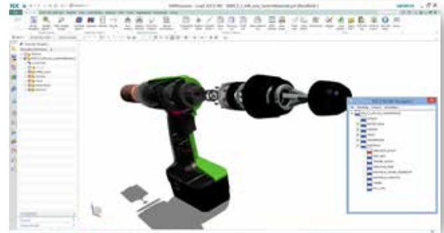
Assemble and Test in a Virtual Environment