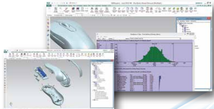
Use Six Sigma - View Primary Contributors to Variation