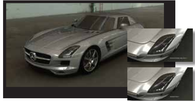
Spec Studies Show Variation

Change tolerances, assembly processes or design characteristics and determine the outcome. Find issues and test solutions before building expensive prototypes or beginning production.